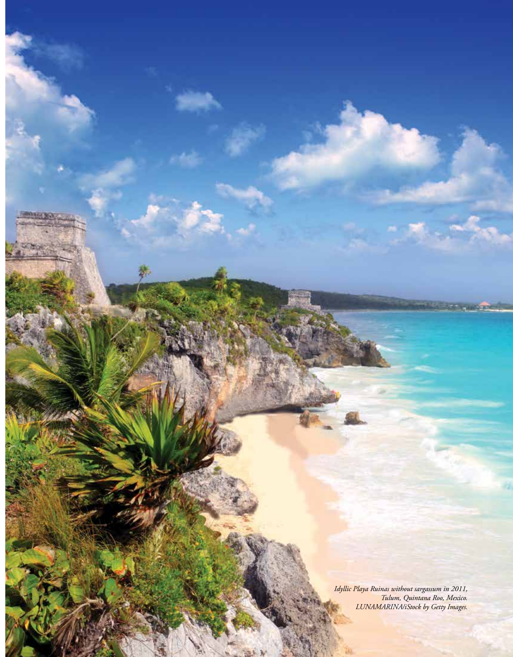
Idyllic Playa Ruinas without sargassum in 2011, Tulum, Quintana Roo, Mexico.