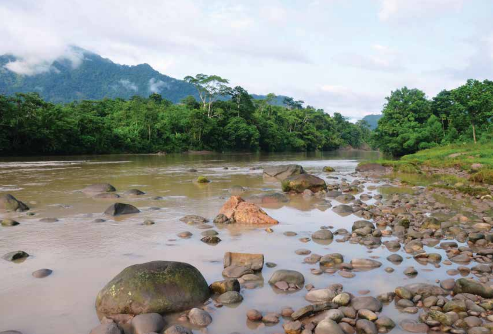
The Cachiyacu River drains part of the Andean Amazon region of Peru. This and other rivers of the region harbor extraordinary biological diversity and support the lives and livelihoods of riparian human populations.

Latin America are still only or most easily accessed by river. For example, Tawaka and Miskito communities in the lowland wilderness of eastern Honduras communicate primarily via the Patuca River and its tributaries. Even some large cities, such as Iquitos, Peru, at the confluence of the Nanay and Amazon rivers, are only accessible by river or air. Rivers have shaped culture and identity for numerous indigenous groups and form an important part of the cosmovision, identity and daily life of many Amazonian inhabitants.