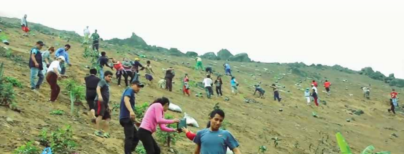
Youth volunteers from the Independencia district of Lima planting native species on the surrounding mountainside to mitigate disaster risk and improve environmental conditions, 2017. The urban neighborhood project is part of a USAID/OFDA-funded initiative spearheaded by the NGO, PREDES.

afforestation area toward keeping this risk at bay for Independencia, triggering a proposal to not only seek legal protection for the afforestation effort but also extend it to informal settlements in the surrounding hills. PREDES rose to the occasion, developing a broad strategy involving stakeholders at national, subnational and local institutions.