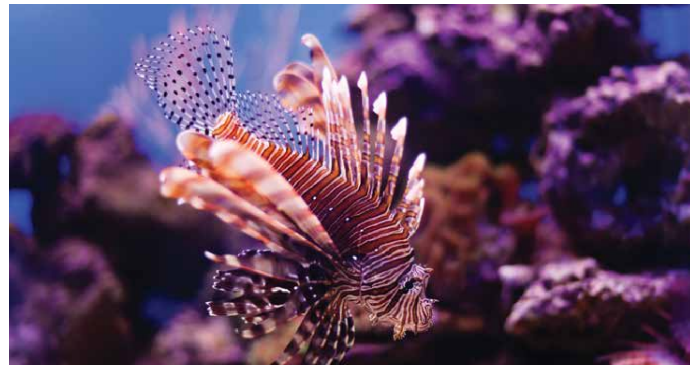
The two greatest threats to conservation programs are climate change and invasive species. The Red Lionfish, which originates in the South Pacific, has invaded Marine Protected Areas and degraded the reef systems' biodiversity in The Bahamas and throughout the Caribbean.

Marine and terrestrial invasive species occur throughout The Bahamas but are concentrated in the northern islands. These islands