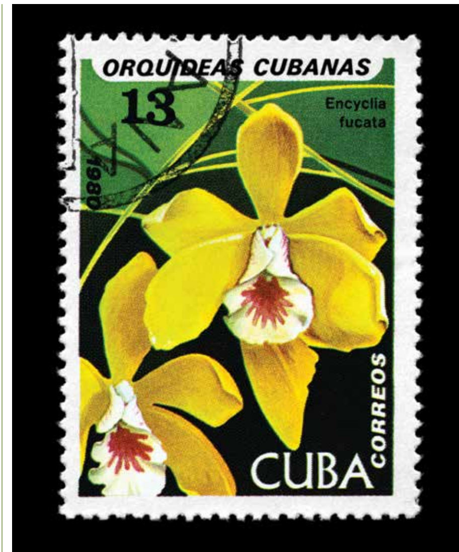
A Cuban stamp of Encyclia fucata from the 1980 "Cuban Orchids" series.

Collaborative projects such as the LOP can have a significant impact on local biodiversity restoration through the reintroduction of extirpated species and play an important role in the overall success of global biodiversity conservation. In the cases of species with broad ranges and distributions spanning multiple borders, each partisan side may understand only a piece of the whole. An exchange of research, ideas and knowledge is necessary to protect and improve the health of threatened species. Establishing cross-border partnerships not only has a positive effect on the resilience of wild orchid populations in the Caribbean region but also upon the survival of flora and fauna globally. Biodiversity conservation actions can range from small-scale local projects to larger-scale international collaborations that begin with an exchange of ideas and end with actions that may ultimately ensure the continued survival of rare, threatened and endangered species.