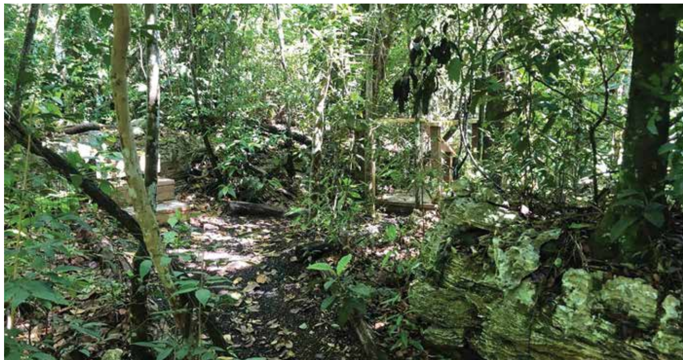
Primeval Forest National Park in southwestern New Providence, Bahamas. Remarkably undisturbed, it is one of the best preserved plots of old-growth woodland in the country. PJOTRAVELER.