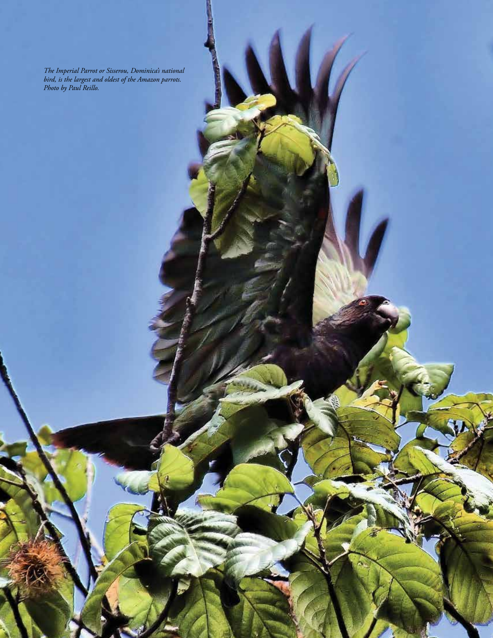
The Imperial Parrot or Sisserou, Dominica's national bird, is the largest and oldest of the Amazon parrots.