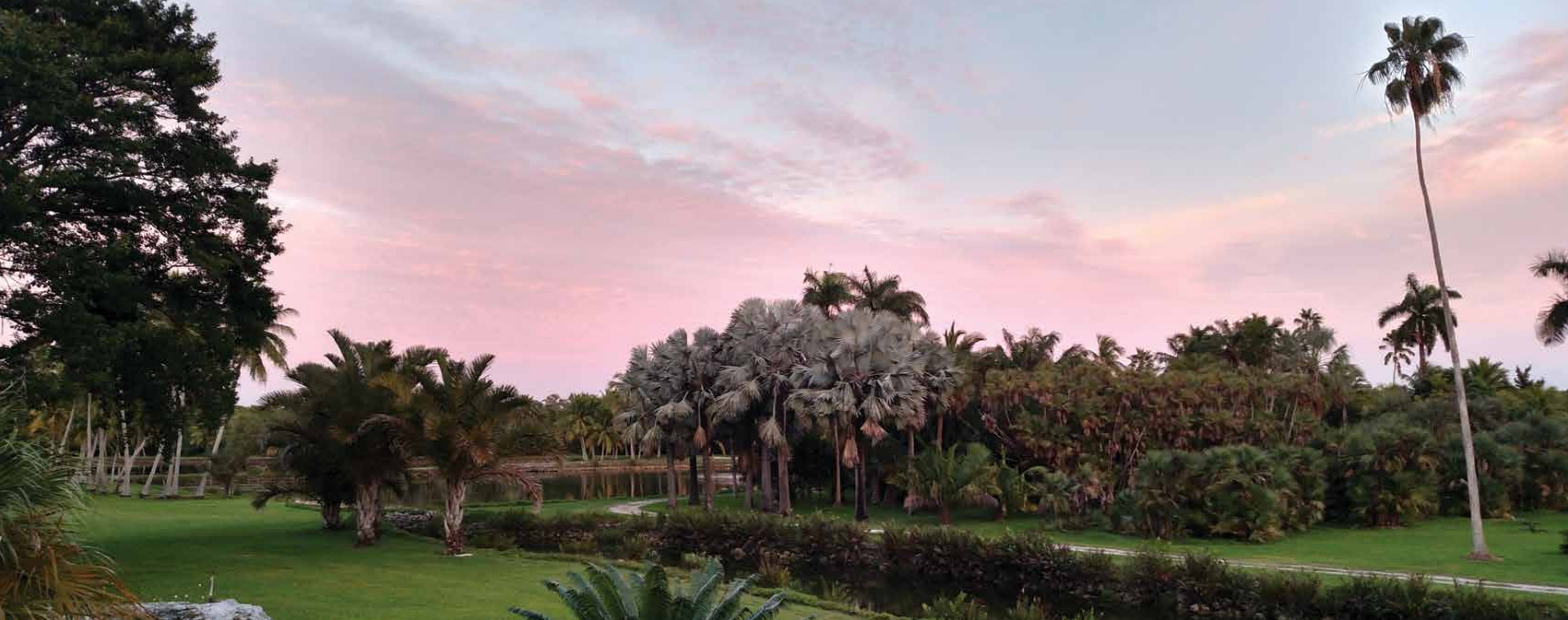
Palm collection at the lowlands of Montgomery Botanical Center in Miami, Florida.