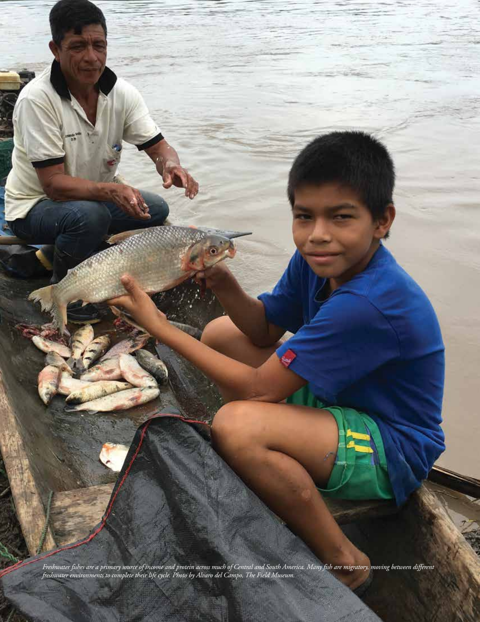
Freshwater fishes are a primary source of income and protein across much of Central and South America. Many fish are migratory, moving between different freshwater environments to complete their life cycle.