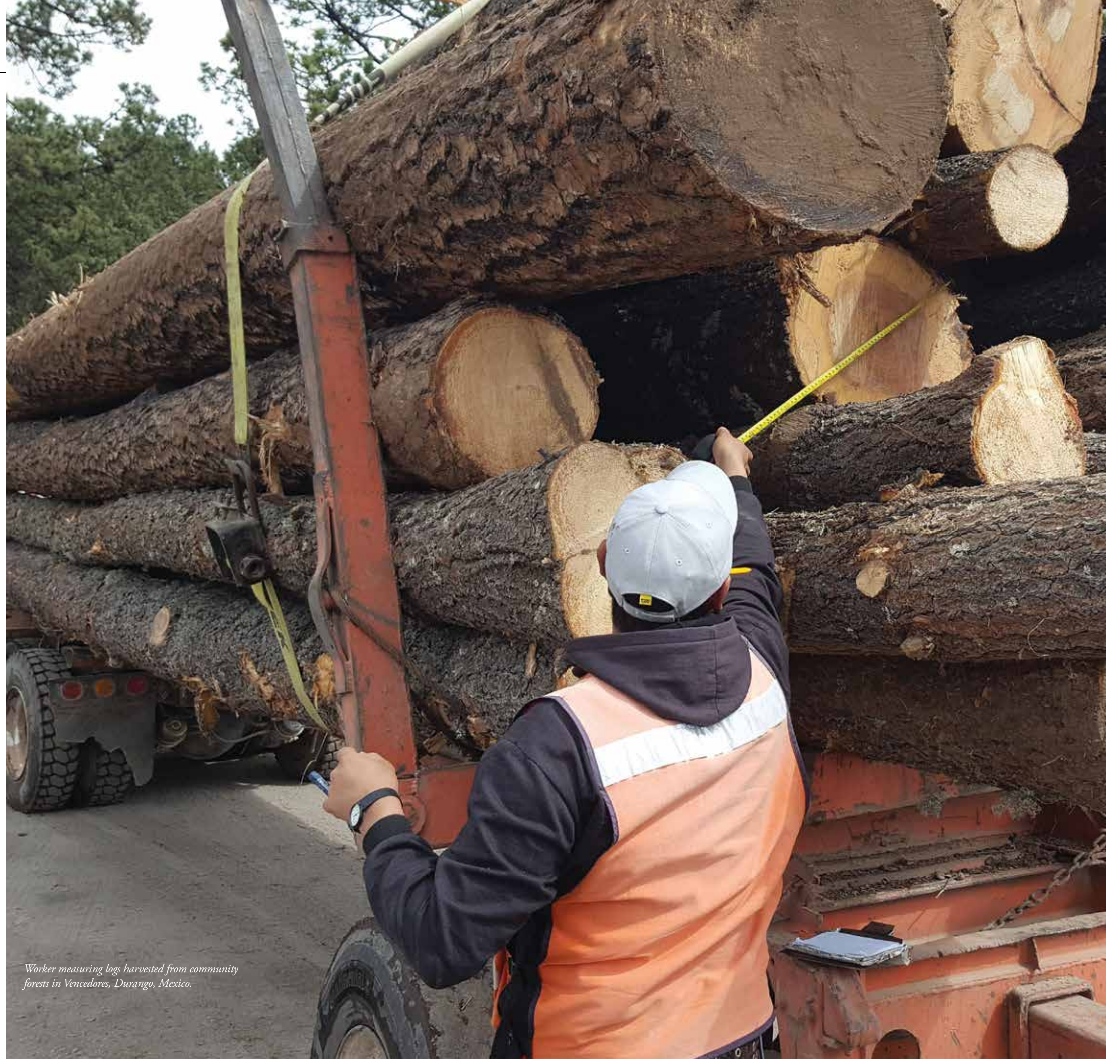
Worker measuring logs harvested from community forests in Vencedores, Durango, Mexico.

The forests of Latin America and the Caribbean have a key role to play in both mitigating climate change and adapting to it. The region's largest source of greenhouse gas emissions, the United Nations Food and Agriculture Organization (FAO) has noted, is deforestation. Yet despite the rapid rate at which forests are being converted to other land uses, mostly agriculture and livestock, the region still leads the world in conserved forests and biodiversity. South America is home to the Amazon Basin, the world's largest carbon sink, and the indigenous territories of Latin America and the Caribbean store more carbon than the forests of the Democratic Republic of the Congo, the world's second largest remaining tropical forest.